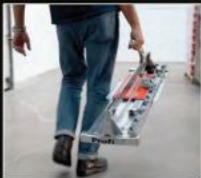
Transport Designed to be easily carried and transported.