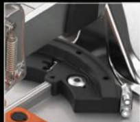
Spare Wheel Spare wheel included.