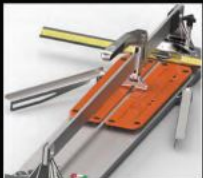
Side Extensions New design of the lateral supports ensures stability when cutting large format tiles.